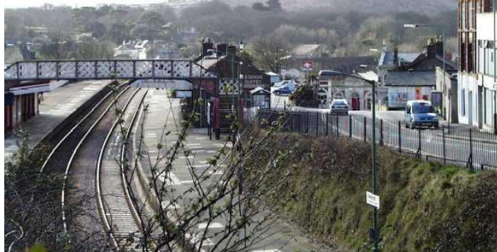
Redruth Station with Cairn Brea in the background, the last view of Redruth most immigrants would see.