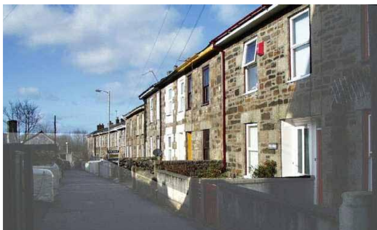
Hoskings Row, Redruth.....