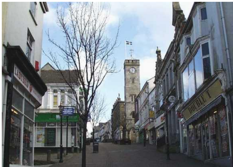
Fore Street, Redruth 2003