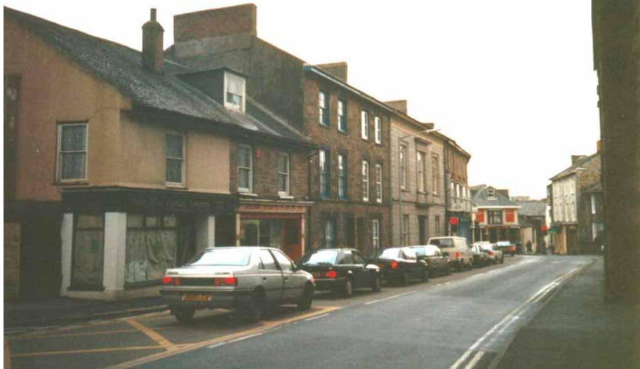
Penryn Street, Redruth.