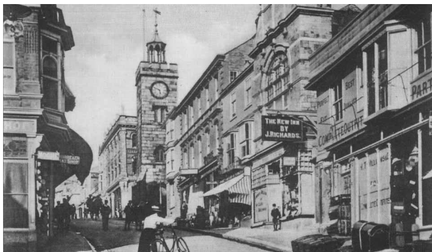
Fore Street, Redruth, 1904 from Redruth, the Archive photographs Series.