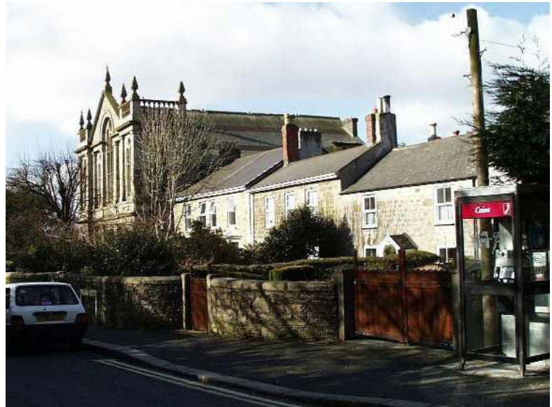
Plain an Gwarry, Redruth