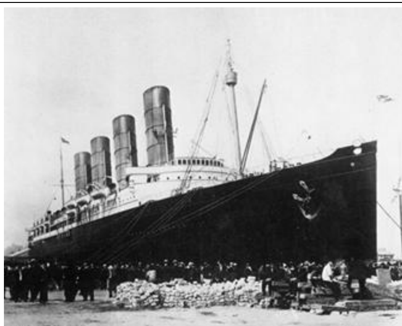
The SS Lusitania, a Cunard liner, which carried many Hollows to America. The ship was sunk without warning by a German submarine on 7 th May 1915. 1255 passengers and 651 crew were lost.