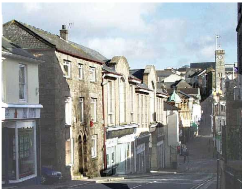
West End looking towards Fore Street