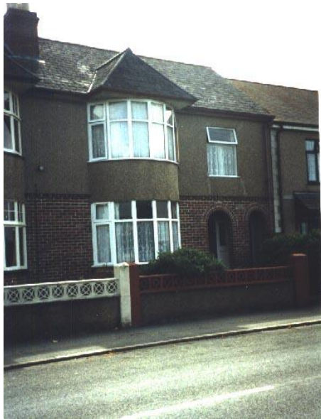
No. 9 Hollow's Terrace