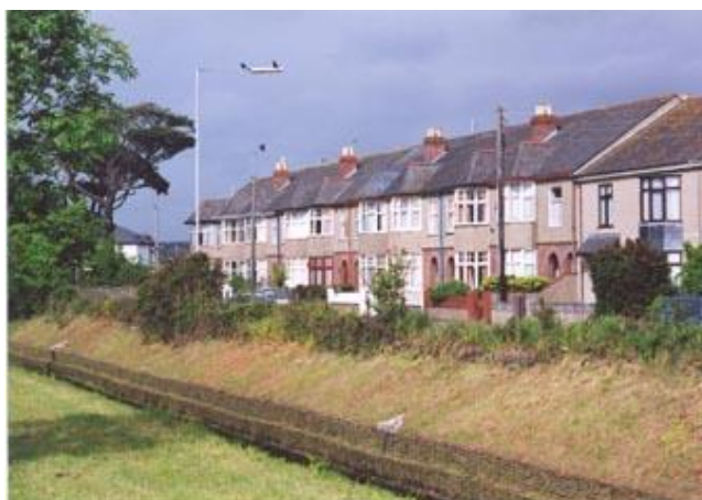
Hollow's Terrace, Hayle