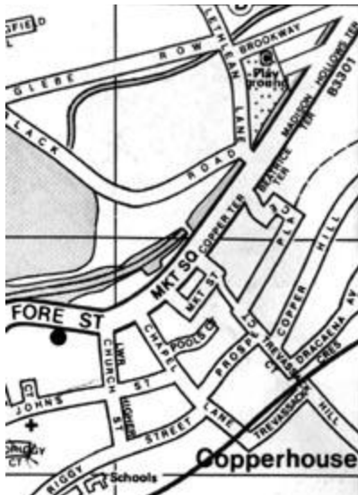
A section of Hayle showing the terraces (top right).